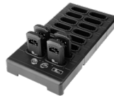
Auri D16 Docking Station 16